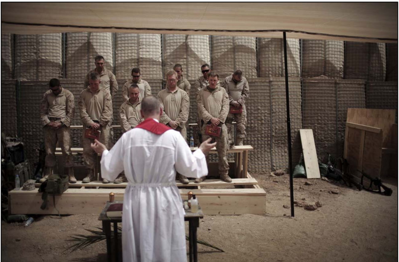
30 A priest leads US Marines of 3rd Battalion, 6th Marines, in prayer during Palm Sunday mass held at their base in Marjah, Helmand province, southern Afghanistan, on March 28, 2010. #