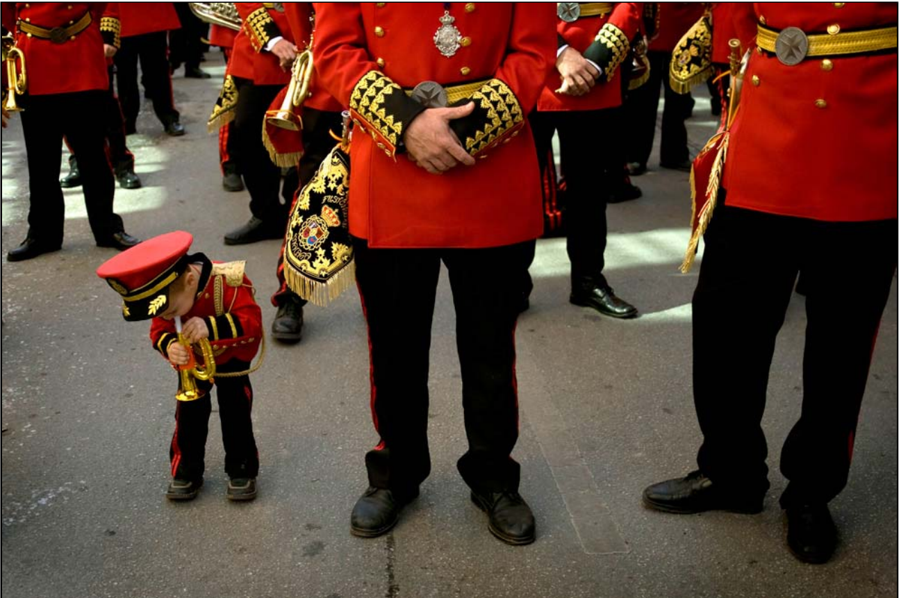
12 A boy plays the trumpet during the "Lagrimas y Favores" brotherhood procession during the Holy Week on March 28th, 2010 in Malaga, southern Spain, during the easter week celebrations. #