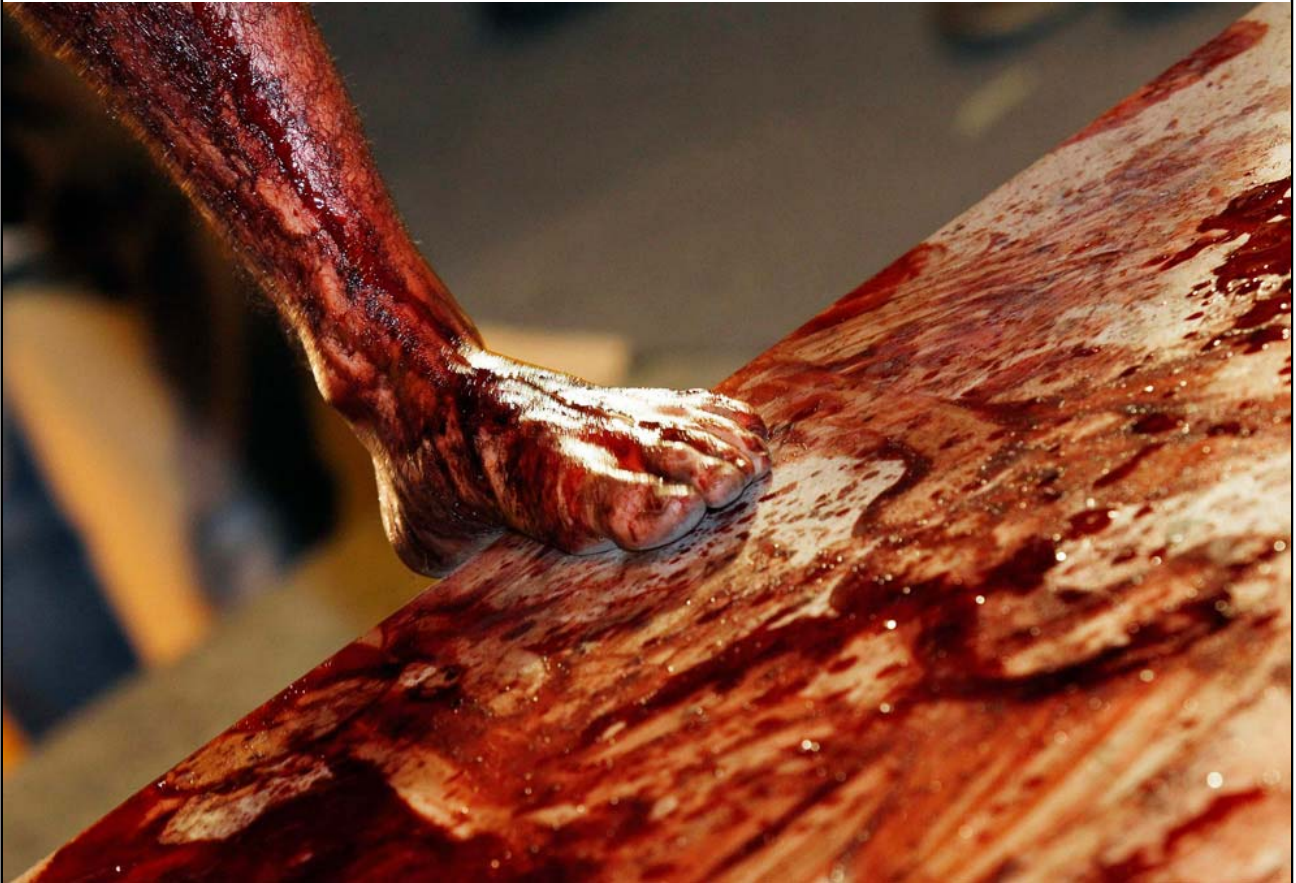
37 The blood-covered leg of a penitent, resting on a bloodied step during a procession through the streets in the town of Verbicaro, southern Italy on April 2, 2010. The penitents, called "battenti", or beaters, hit their legs with a "cardillo" (a cork with attached pieces of glass) and walk, bleeding, in groups of three through the streets, stopping in front of all the churches and chapels in the town. The tradition began in the thirteenth century and serves as penitence for Christ's death. #