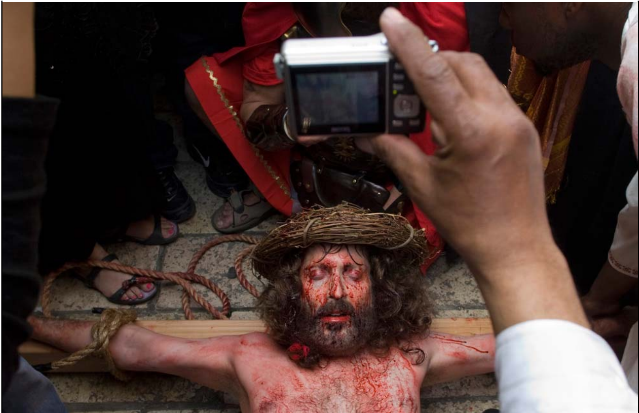
33 A Christian pilgrim dressed as Jesus Christ, is photographed while lying on a cross during a reenactment of the crucifixion during a Good Friday procession in Jerusalem's Old City, Friday, April 2, 2010. #