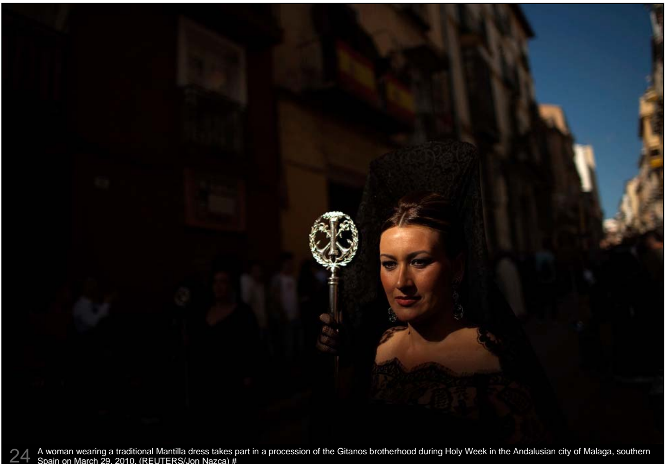
24 A woman wearing a traditional Mantilla dress takes part in a procession of the Gitanos brotherhood during Holy Week in the Andalusian city of Malaga, southern Spain on March 29, 2010. #