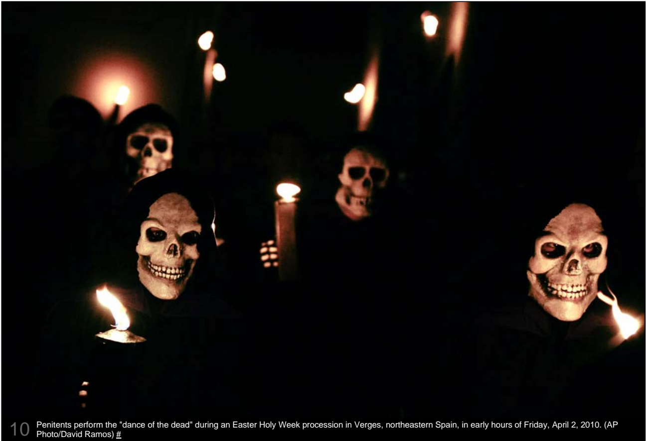
10 Penitents perform the "dance of the dead" during an Easter Holy Week procession in Verges, northeastern Spain, in early hours of Friday, April 2, 2010. #