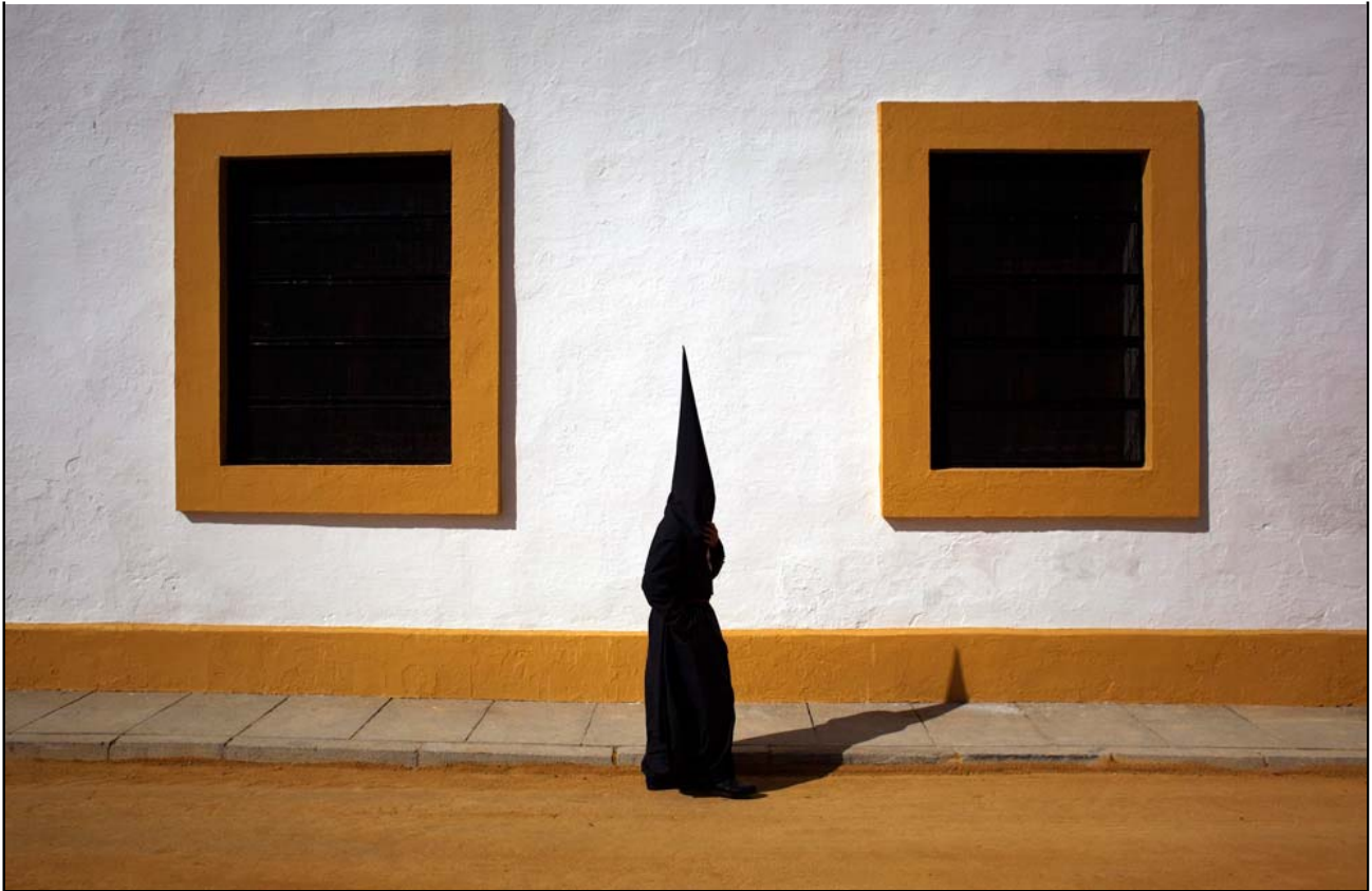
2 A penitent from "La Sed" brotherhood, walks to the church to take part in a procession in Seville, Southern Spain, Wednesday, March 31, 2010. Hundreds of processions take place throughout Spain during the Easter Holy Week. #