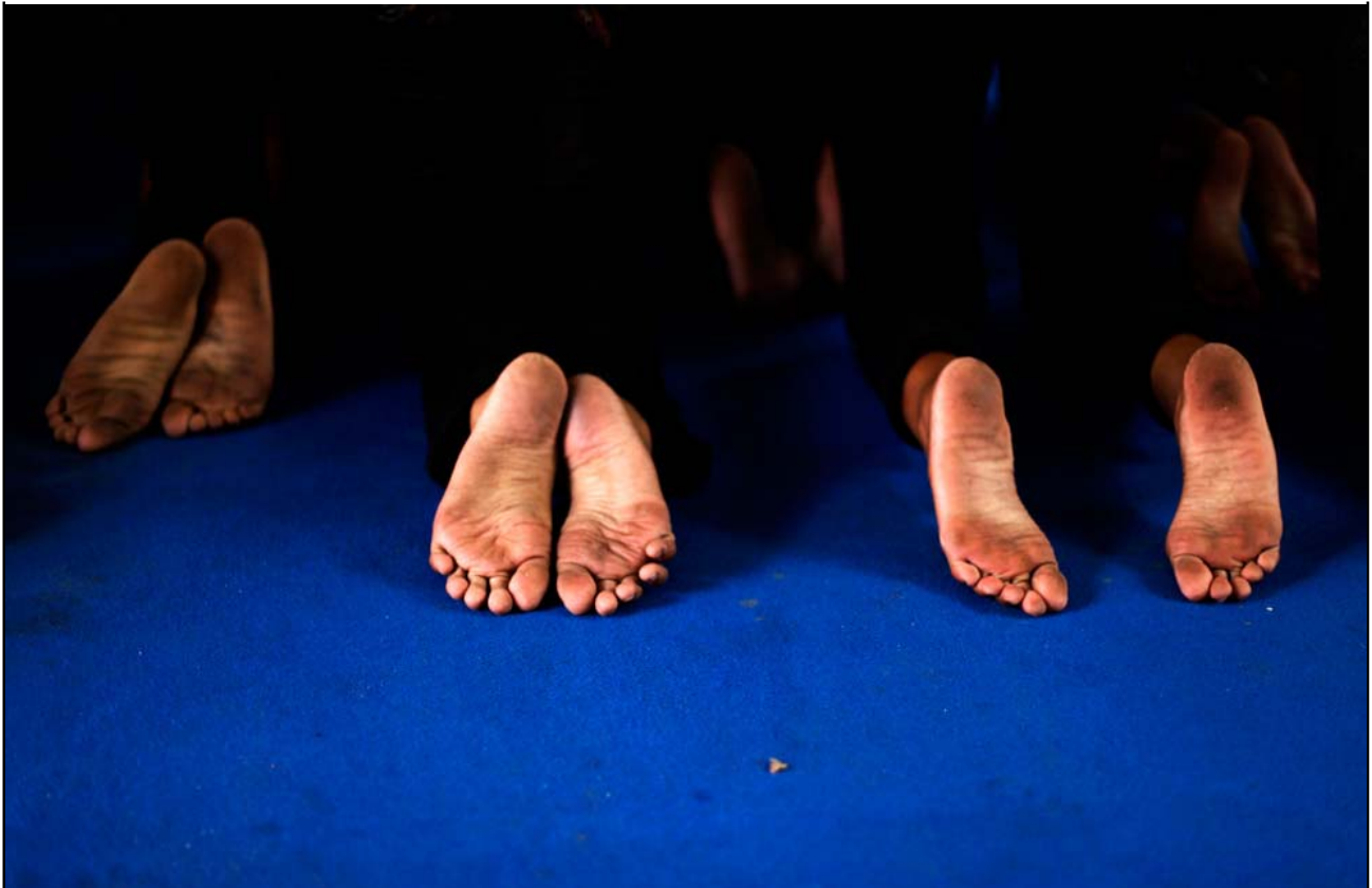
4 Roman Catholic worshippers pray in front of a Tuan Ma (Mother Mary) statue at a church during Holy Week in Larantuka on Flores Island in Indonesia on April 1, 2010. Worshipers said they visit five churches to celebrate the 500 year anniversary of the discovery of the Tuan Ma (Mother Mary) statue. They believe the statue, which was found in Flores in 1510, is the basis of a new religion that has replaced animism on the island. #