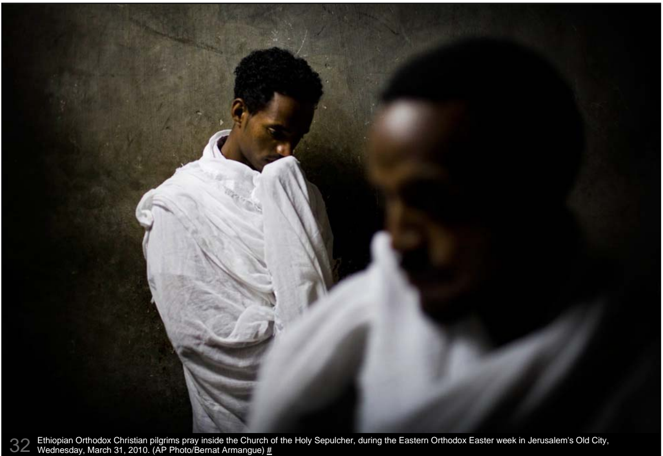
32 Ethiopian Orthodox Christian pilgrims pray inside the Church of the Holy Sepulcher, during the Eastern Orthodox Easter week in Jerusalem's Old City, Wednesday, March 31, 2010. #