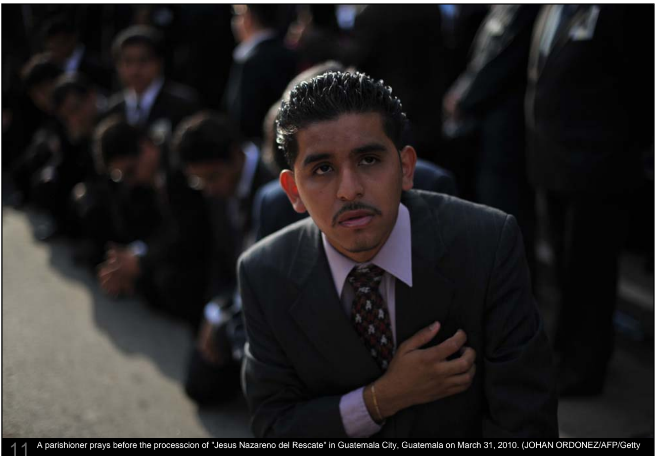
11 A parishioner prays before the procession of "Jesus Nazareno del Rescate" in Guatemala City, Guatemala on March 31, 2010.