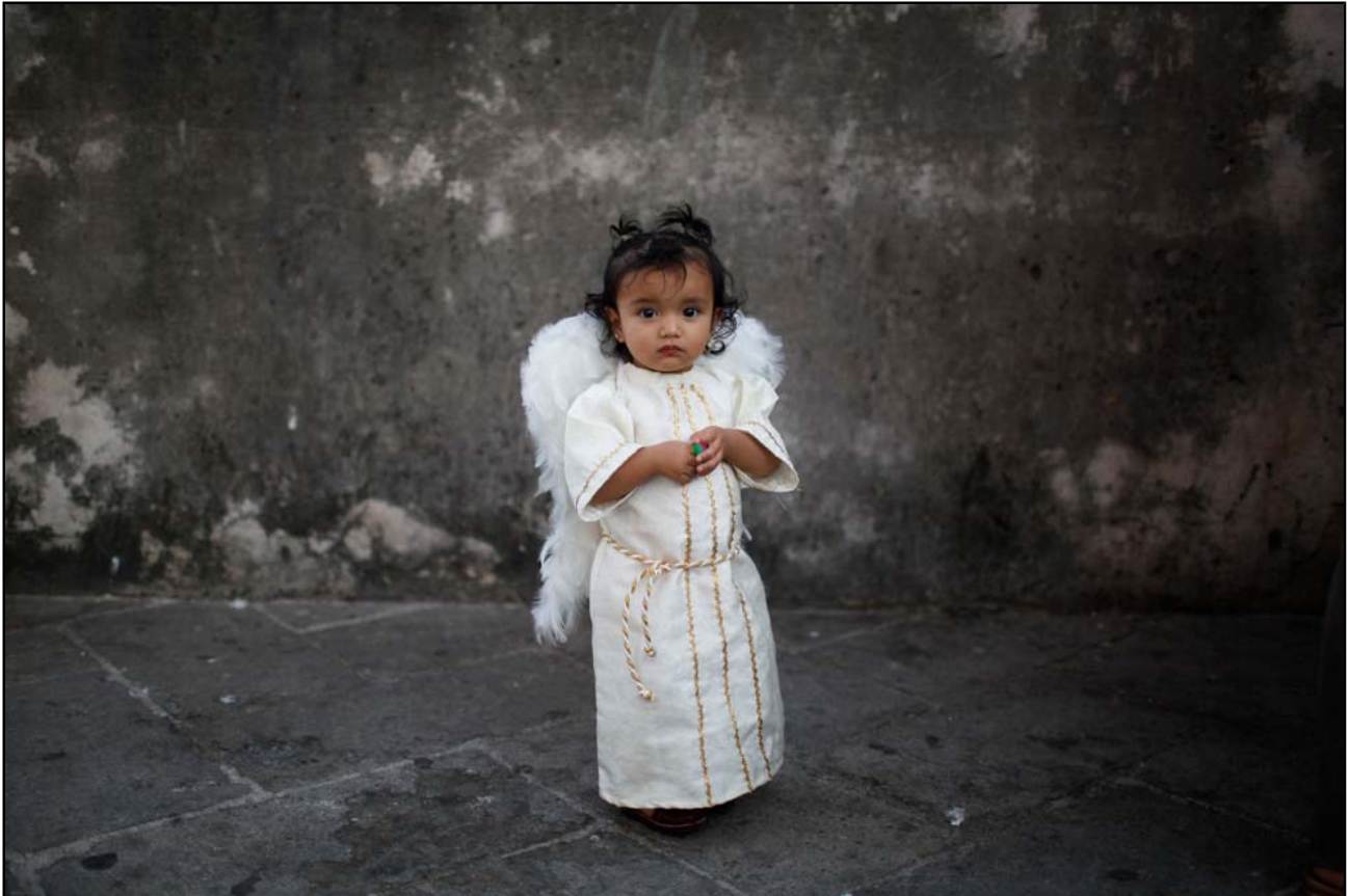
39 A girl dressed as an angel awaits a procession of penitents during Holy Week in Taxco, Mexico, Thursday, April 1, 2010. #