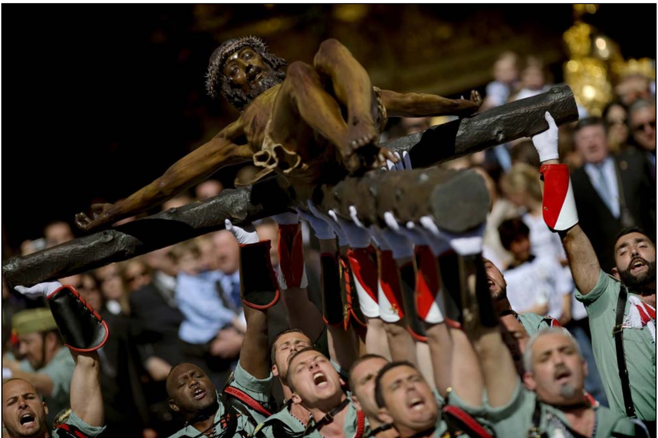
28 Members of the Spanish Legion carry the icon, Christ of the Good Death, to the Santo Domingo de Guzman Church during an easter procession on April 1, 2010 in Malaga, southern Spain. #