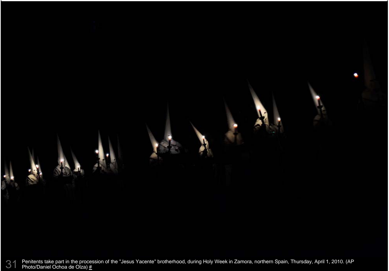
31 Penitents take part in the procession of the "Jesus Yacente" brotherhood, during Holy Week in Zamora, northern Spain, Thursday, April 1, 2010. #