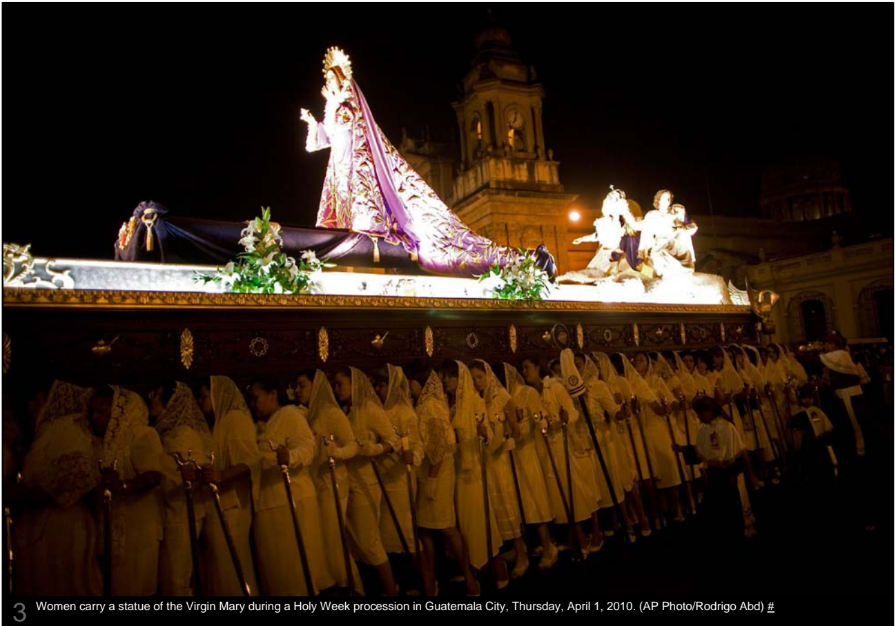
3 Women carry a statue of the Virgin Mary during a Holy Week procession in Guatemala City, Thursday, April 1, 2010. #