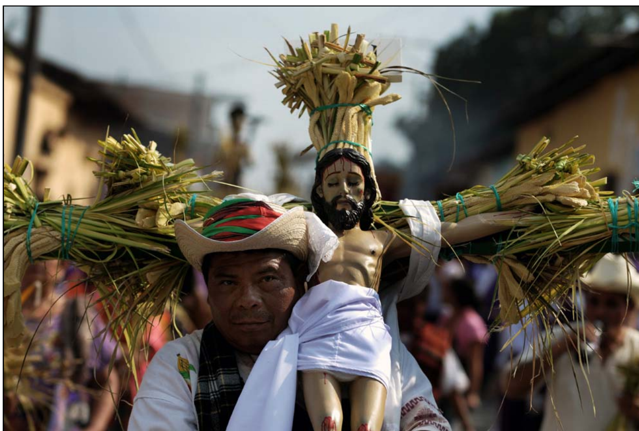
7 A member of a brotherhood carries a statue of Christ during a procession in honor of "Jesus of Nazareth" in the town of Izalco, 60 km west of San Salvador, El Salvador on April 1, 2010. #