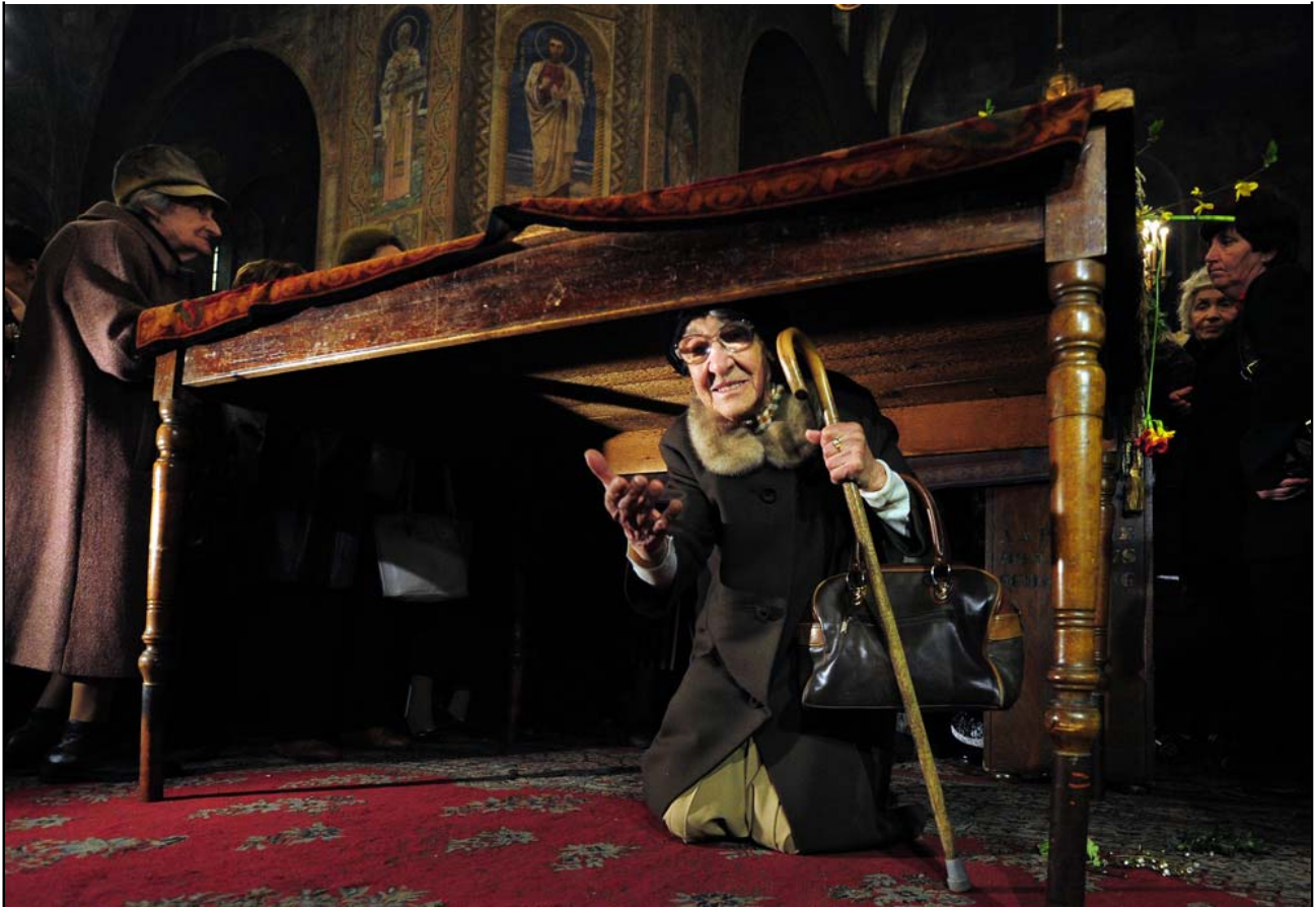
19 A woman passes beneath a table where the Bible is placed during the Good Friday service in the golden-domed Alexander Nevski cathedral in Sofia, Bulgaria on April 2, 2010. #