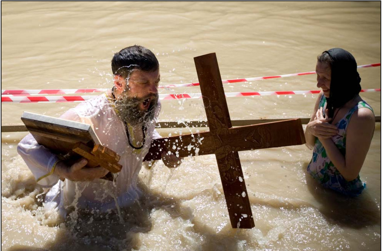
29 Orthodox Christians immerse themselves in the Jordan River at a baptism ceremony, during Holy Week, at Qasr el Yahud near the West Bank town of Jericho, Wednesday, March 31, 2010. The site is traditionally believed by many to be the place where Jesus was baptized. (AP Photo/Ariel Schalit) #