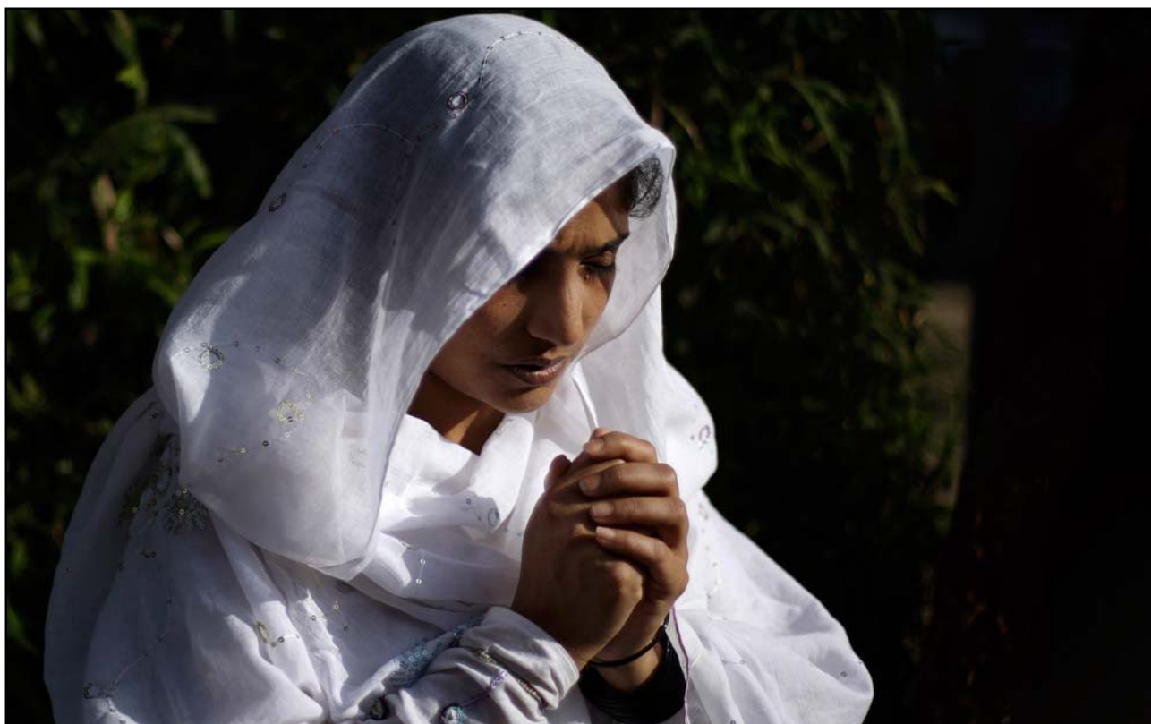
6 A Pakistani Christian woman prays during a mass on Orthodox Palm Sunday, at Fatima Church in Islamabad, Pakistan, Sunday, March 28, 2010. #