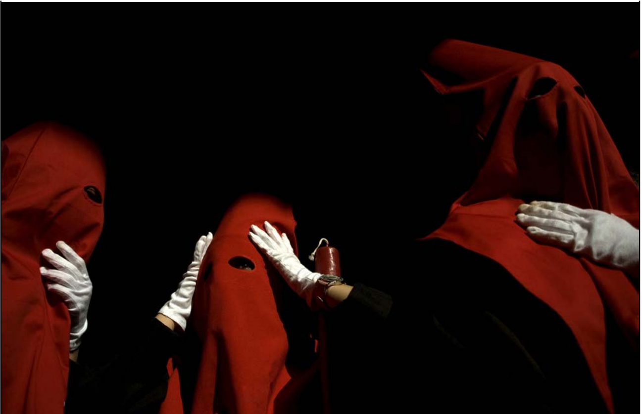
21 Penitents adjust their hoods as they take part in the "Fusionadas" brotherhood procession during the Holy Week in Malaga, Spain on March 31, 2010. #