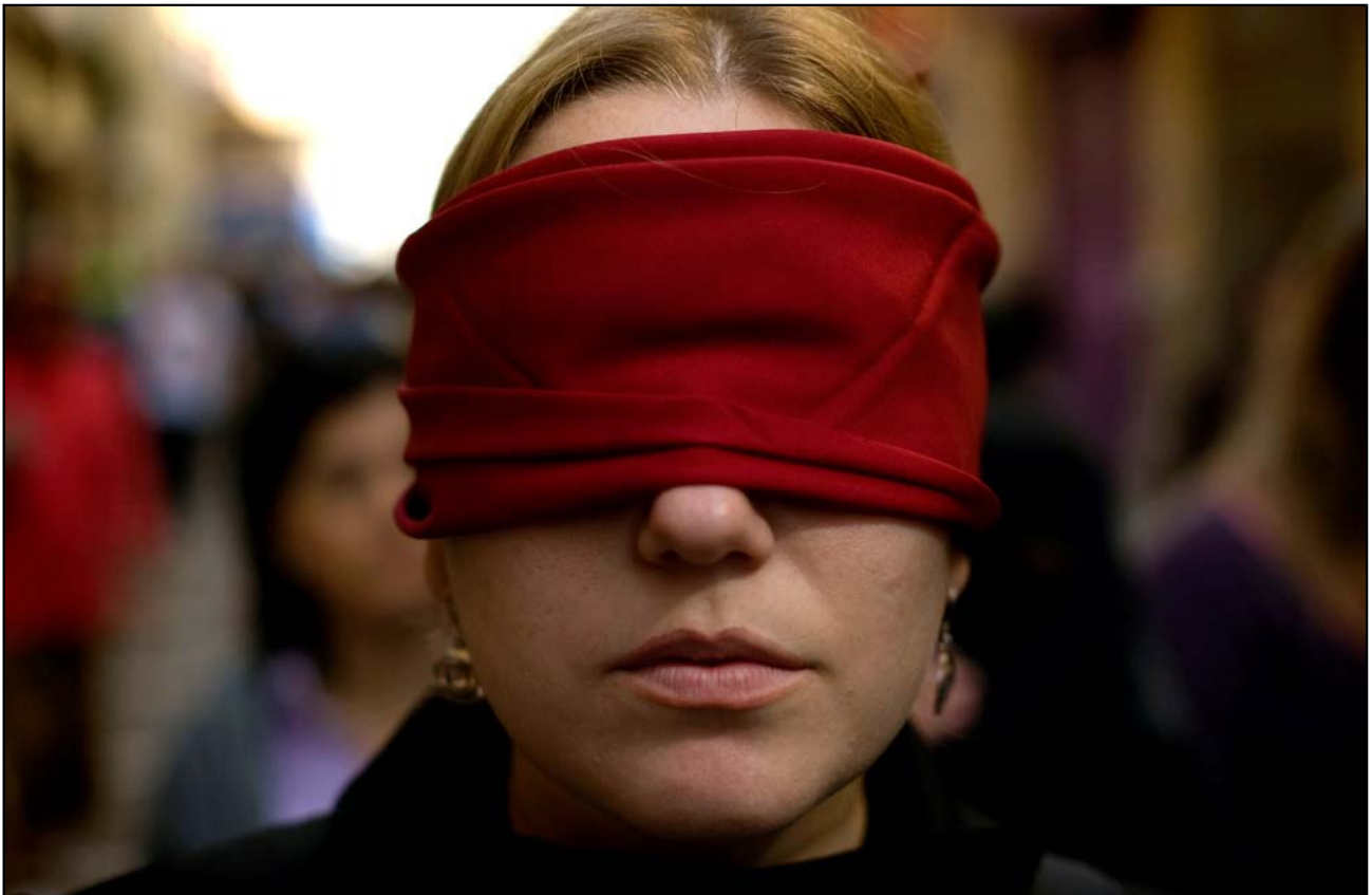
36 A penitent wears a blindfold during the "Lagrimas y Favores" brotherhood procession during the Holy Week on 28 March 2010 in Malaga, southern Spain, during the Easter week celebrations. #