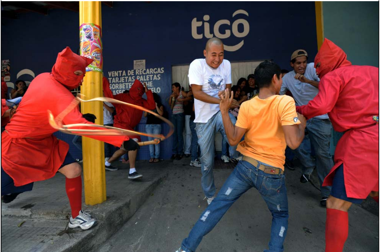
27 A masked Christian dressed as a devil, popularly known as a "Talsiguin", lashes a man from the crowd during the celebration of an ancient local Catholic tradition which marks the start of Holy Week, on March 29, 2010 in Tuxtla Gutierrez, Mexico. Catholic faithful are lashed by the Talsiguines to cleanse their sins. #