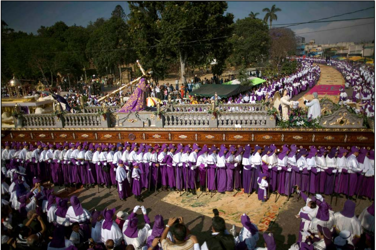
35 At least one hundred penitents carry the image of Jesus Christ during a Holy Week procession in downtown Guatemala City, Guatemala on Thursday, April 1, 2010. #