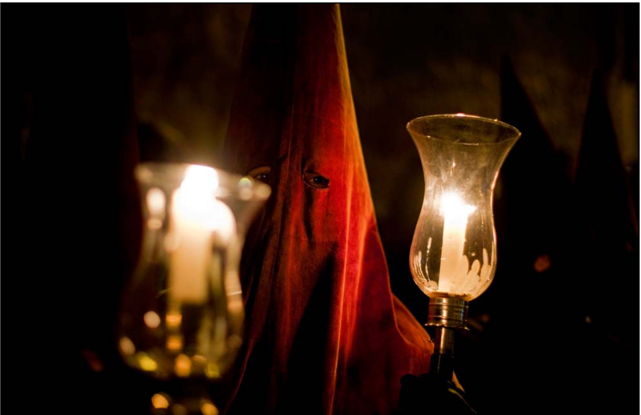
38 A penitent participates in the Camino del Calvario procession, popularly known as "Turbas", in Cuenca, Spain early Friday, April, 2, 2010. #