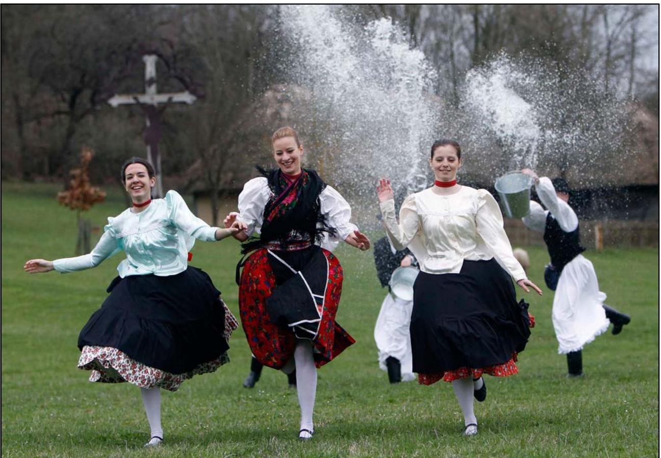
9 Girls run as boys throw water at them as part of traditional Easter celebrations in the village of Szenna, Hungary on April 2, 2010. Locals from Szenna celebrate Easter with a traditional "watering of the girls", a fertility ritual rooted in Hungarian tribes' pre-Christian past, going as far back as the second century after Christ