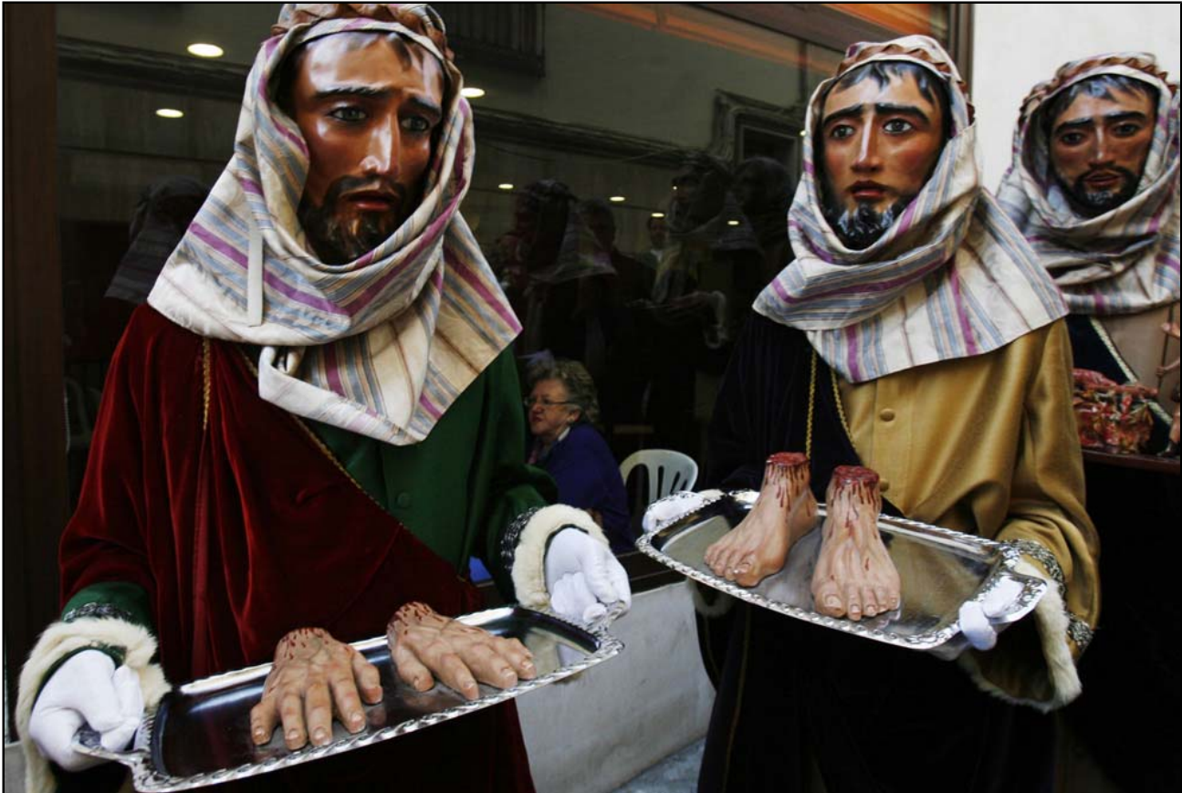
34 Penitents dressed as different Biblical characters wait for the start of the "Nuestro Padre Jesus Preso" brotherhood procession during Holy Week in Puente Genil, near Cordoba, southern Spain, April 1, 2010. Hundreds of men dressed as characters from the Old and New Testaments parade alongside other penitents who carry floats bearing sculptures of Christ and the Virgin and models of biblical scenes during Holy Week in Puente Genil. #