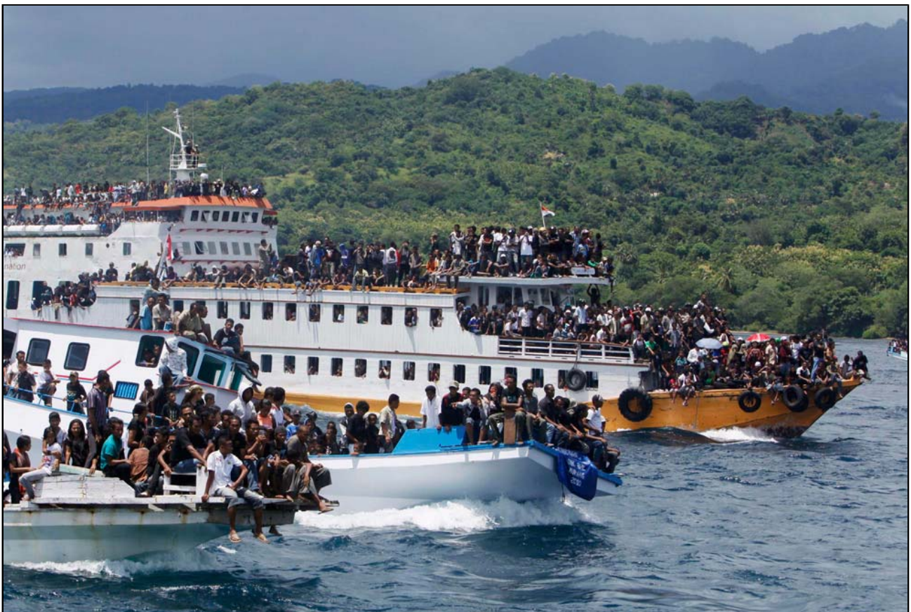
5 Roman Catholic worshippers gather on boats as they follow the procession accompanying a statue of Jesus Christ as it is transferred to another church during Holy Week off the Larantuka sea, Indonesia's Flores Island on April 2, 2010. #